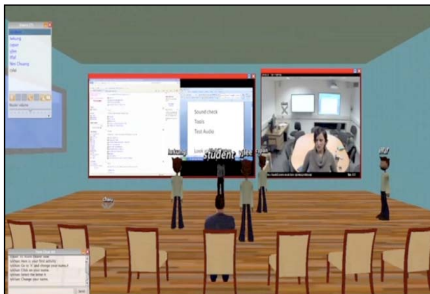
Figure 4. A MiRTLE class as seen by a participant.

The original objective of MiRTLE was to provide a mixed-reality environment for a combination of local and remote students in a traditional instructive higher education setting. The mixed-reality environment links the physical and the virtual worlds, augmenting existing teaching practices with the ability to foster a sense of community among remote students and between remote and co-located venues. This fits within our longer-term vision, which is to create an entire mixed-reality campus; so far we have developed the first component in this process: a mixed-reality classroom. MiRTLE has been built using the OpenWonderland toolkit to construct virtual classrooms (Figure 4).