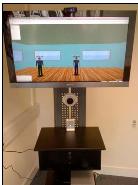
Figure 5. The \mu MiRTLE prototype.

We have so far built dedicated MiRTLE teaching rooms and are now investigating a more portable version of MiRTLE that we call " mobile MiRTLE " ( \mu MiRTLE) which can be easily wheeled into a classroom and used by the teacher (as shown in Figure 5).