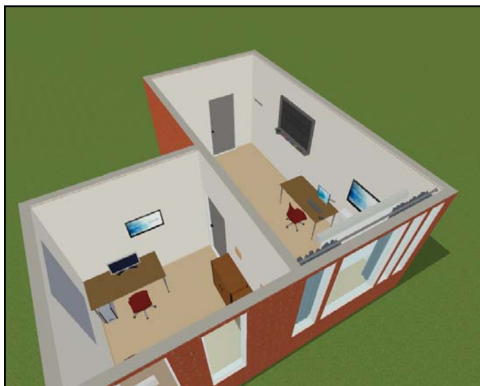
Figure 2. A 3D model of our iClassroom during development.

operational part of our classroom that participants will experience. This leaves a smaller space (3m x 3m), itself an “ intelligent office ”, that is intended to harbour developers / observers as they carry out their research (possibly while the operational part of the classroom is in use), but is also to be used for housing equipment (including servers, automation devices, network cabinet, etc.). To facilitate the deployment of necessary technologies, both as part of the original design and as later augmentation, false walls and ceilings provide hiding places for embedded devices / sensors. These are then over-populated with power and Ethernet sockets in support of the electronic artefacts they will eventually yield. All Ethernet sockets are wired to a central patch panel and are interconnected to form a network that is isolated from the rest of the university. A single access point provides secure wireless access to the iClassroom network, while a gateway / firewall provides internet access, basic network services (such as DHCP) and also allows certain service requests to be handled from outside the iClassroom. Overall, this forms a raw skeleton into which ubiquitous computing can be embedded – a procedure of deployment that has become our modus operandi .